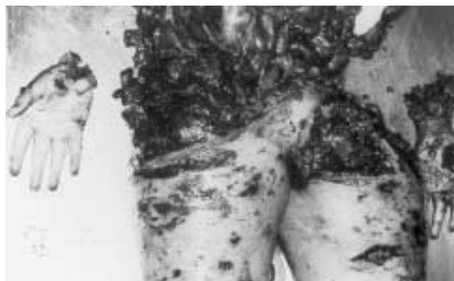
Figure 2. Radiograph of a victim of a suicide bombing. Within the thoracic cavity, detonators from the explosive device and metallic shrapnel were detected.

The great majority of victims examined died as a result of explosive injuries from bombings. These attacks were perpetrated either by suicide bombers carrying the device strapped to their bodies, or by bombs placed in public areas. The detonations were not always